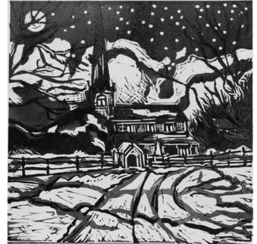
Used by permission. Christmas cards featuring Huggate Church are still available from Belinda Hazlerigg, Plum Tree House

and are making donations to charity rather than sending individual cards